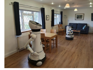
Figure 1: An image of the environment which would then be replicated into the Virtual Reality (VR) space.

The first test case is to create an environment and space to work with the mobile manipulator robot, Fetch, along with the base initial environment that we would use to replicate the space of a standard home in the VR space as in Figure 1. As we are concerned with assistive robotics, [12] identified that the average age range of the